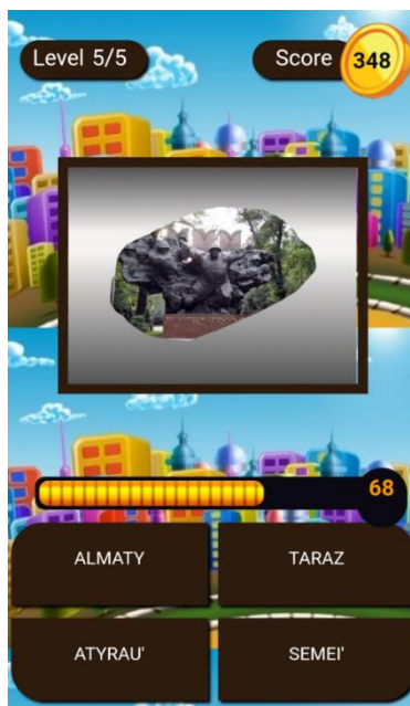
Figure 3 – Mobile game «Travel» for training Latin alphabet.

In computer games and mobile applications for children learning Latin, graphics are considered teaching the spelling rules and practical application of Latin graphics. In addition, the main result of this research is the preparation of digital electronic book accompanied by audio and video materials.